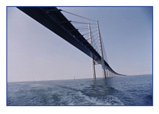
Views of the bridge from below and above.

Øresund Bridge crosses the strait between Sweden and Denmark and helps to link the two countries.