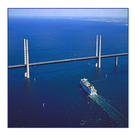
The Øresund Bridge is a combined railway and motorway cable-stayed bridge that is 7,845 m in length.